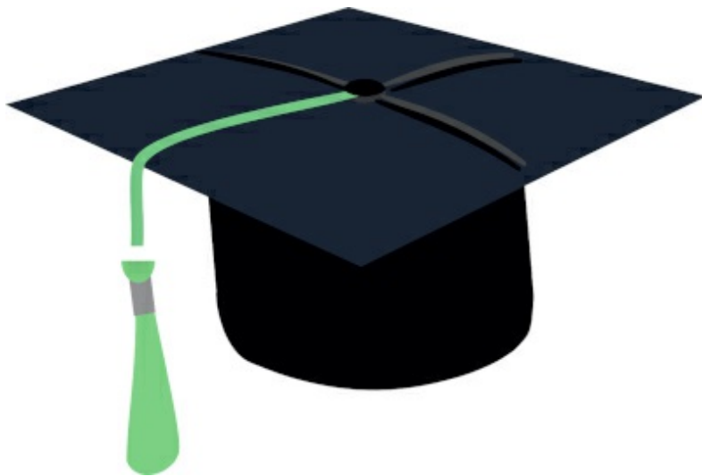
Books & Book Contributions